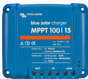
Solar charge controller MPPT 100/15