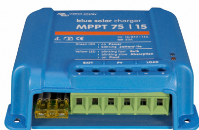
Solar charge controller MPPT 75/15